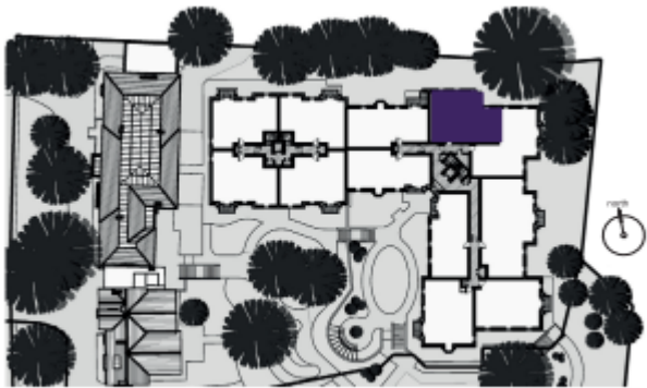
Site location plan